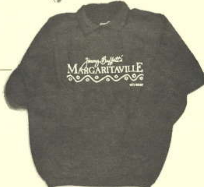
RUGBY STYLE PULLOVER