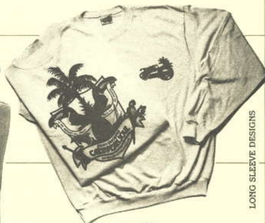
LONG SLEEVE DESIGNS