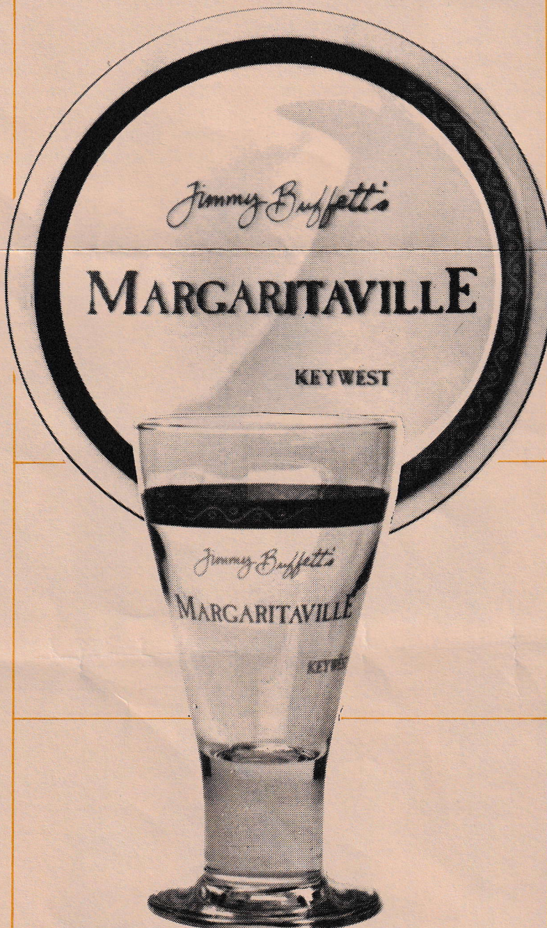
NEW MARGARITAVILLE GLASSWARE

Margaritaville logo embroidered on a 100% cotton knit sweater. High quality sweater available in Natural, Navy, Peach or Yellow. Size S, M, L, & XL $49.00