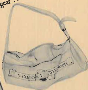
23 x 12 26 x 12

NEW — THE CT TOTE BAG: Handmade in Key West, this versatile sailcloth bag sports the "Telegraph" logo. Water resistant — perfect for exercise wear, party supplies, sailing gear ... $40.00.