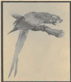
Palm Island Parrot