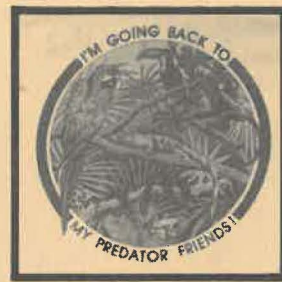
Predator Friends — back