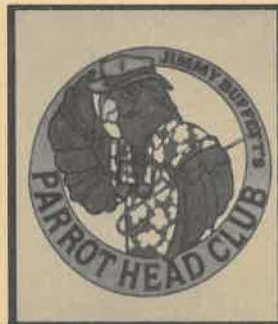
Official Parrot Head