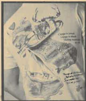
Changes in Latitude — back