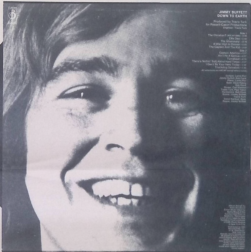
Jimmy Buffett — honest! — pictured on the Down to Earth album.

He hung out in Key West, quaffing drinks at Sloppy Joe's and elsewhere, writing songs, getting drunk, and writing more songs. While others would have given up, Jimmy communed with the creative karma of Key