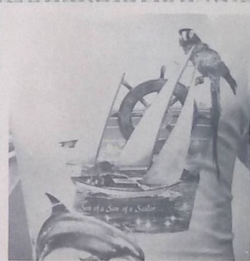
PALM ISLAND PARROT: Where's the party? Just ask our wise old bird... he's seen it all.