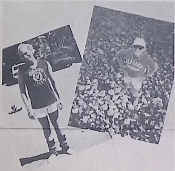
JB POSTCARD PACK: Postcards of Jimmy and the Perfect Margarita recipe could lead to the start of a well-deserved overdue binge! 6 oversize cards for $5.00.

OF A SAILOR: Restless? Let's on the sea for adventure—or out town!