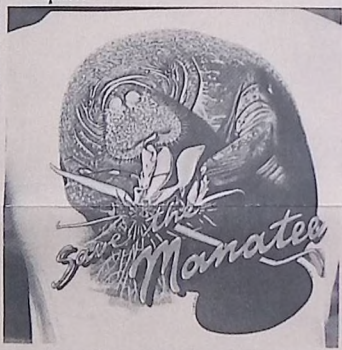
SAVE THE MANATEE CLUB SHIRT: Show your support for Jimmy's mellow manatee buddies. T-shirt is 50% cotton, 50% polyester. $10.00 apiece.

All Caribbean Soul T-shirts pastels like ocean aqua, sun mango peach, cool white, and These shirts are $12.95, and