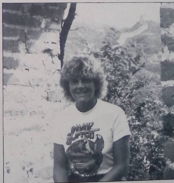
Now she's somewhere over China . . .

Last but not least, the latest word on the eagerly-awaited Margaritaville Movie is that filming will begin in November. We can't wait—can you?