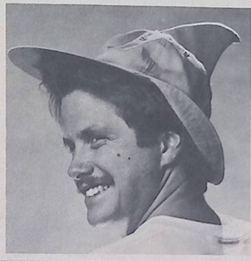
FIN HAT: Our long-billed fishing cap is perfect for all those land sharks on the prowl. Colors are khaki, blue, grey, and white. S, M, L, XL. $16.00.

—full moon—and you've got s pulsing in your veins. Time ng at forty and wicked railroad bean Soul T-shirts, with their tt's songs, and do your bit to life. Let's all howl tonight! ts are 100% cotton in tropical se yellow, conch shell pink, , driftwood grey, and suntan. ome in sizes S, M, L, and XL.