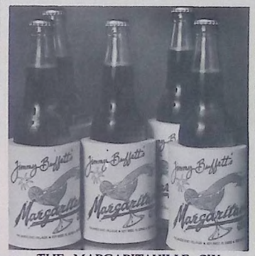
THE MARGARITAVILLE SIX-PACK: Take your cold ones with you and live it up in style. 6 assorted coolers for $15.00.

LIVE BY THE BAY: It's a ringside seat to the best Buffett celebration of them all—a 90-minute concert video full of tunes . . . and people your parents should have warned you about. VHS or BETA. $29.95.