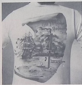
ONE PARTICULAR HARBOUR: Been ruling your world from a pay phone for too long? It's time to hang it up and PARTY!

It's a steamy island night those hard Caribbean rhythms for all you rakish pirates look ladies to slip into your Caribbean designs based on Jimmy Buffet preserve Margaritaville's wild