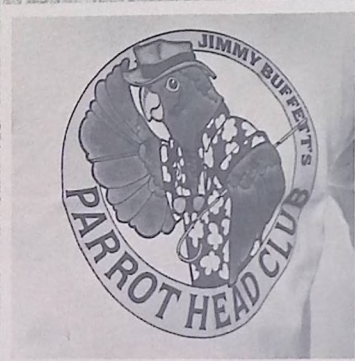
THE OFFICIAL PARROT HEAD SHIRT: A feathered friend who surely knows how to party just like Bubba does—join the Club!