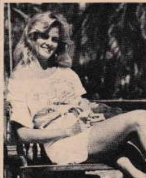
Who Is This Blonde Stranger?

Our unidentified Employee of the Month drifted in on a tropical breeze and has created a heat wave in Margaritaville ever since. Even after giving, in the words of one critic, ". . . an incredibly moving, sensitive portrayal of a couch potato . . ." at Jimmy's recent Fort Lauderdale concert, she still rejects the limelight to work at Margaritaville. Her reasons? "I've been listening to Jimmy's music for years, and feel fortunate to be a part of the Margaritaville Family."