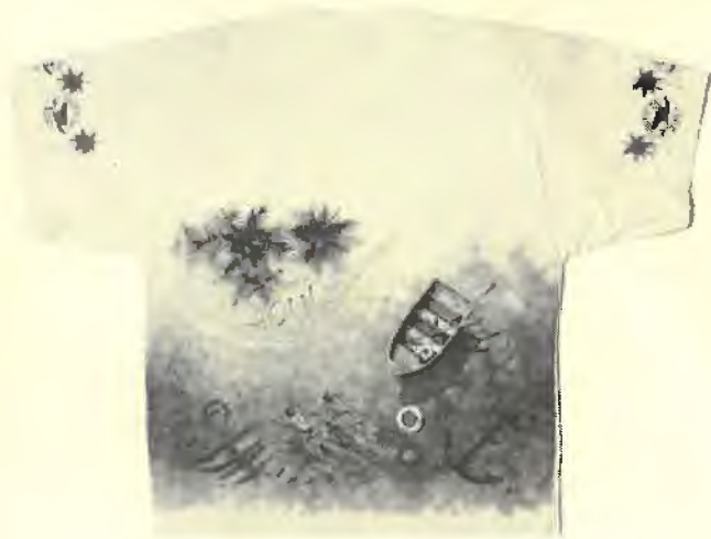
"TALES OF THE TROPICS" Tropical tails beautifully silk screened on 100% cotton shirt. One Size Fits All. $20.00