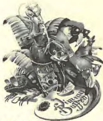
CARIBBEAN COLA Caribbean Soul characters "hangin' out". Size M,L,& XL. $14.95

100% COTTON CREW NECK T'S. AVAILABLE IN WHITE, YELLOW, BLUE, BEIGE, OR MINT.