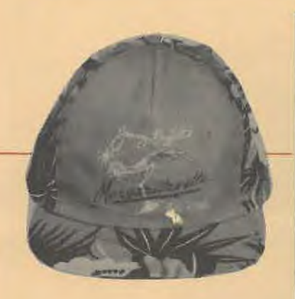
MARGARITAVILLE BALL CAPS