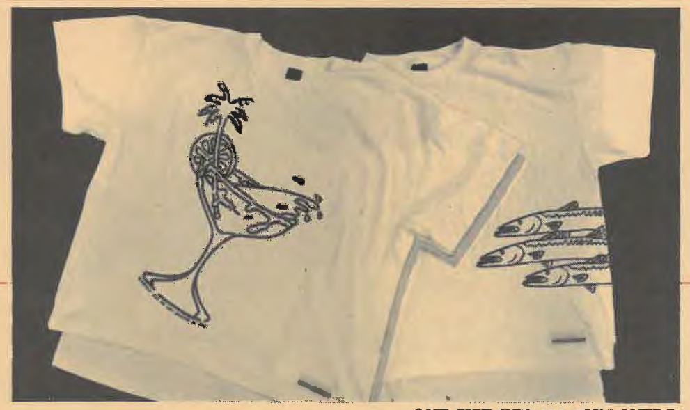
ONE SIZE FITS ALL PULLOVERS